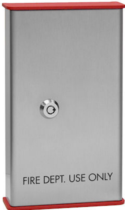
HIGH SECURITY FIRE KEY BOX Model HS-KB52219